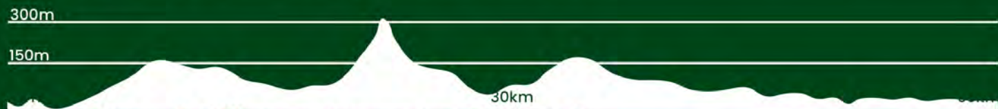
Cahersiveen to Killarney | Elev Gain: 666m/ 2185ft