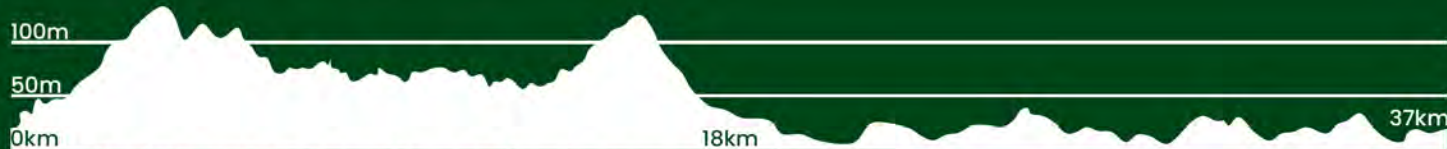
Glenbeigh to Cahersiveen | Elev Gain: 413m/ 1355ft