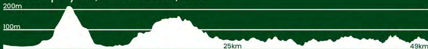
Tralee to Glenbeigh | Elev Gain: 530m/ 1738ft