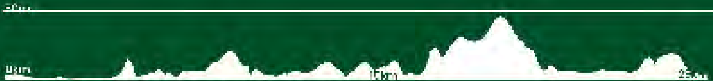
Fenit Loop Cycle | Elev Gain: 200m / 656ft

Please see below daily elevation graphs for your selected tour