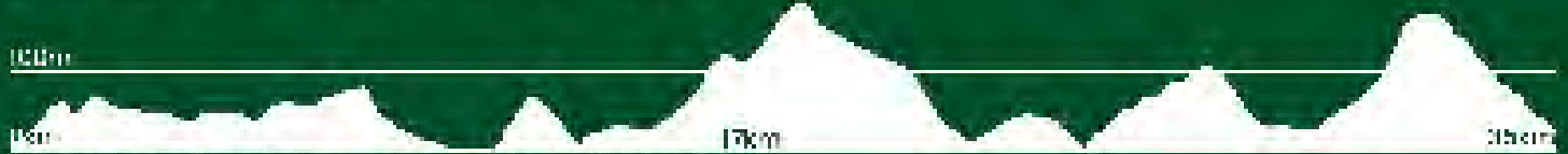
Dingle to Inch | Elev Gain: 365m / 1198ft