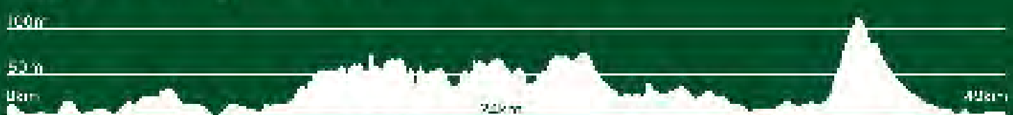
Slea Head Loop | Elev Gain: 528m / 1732ft