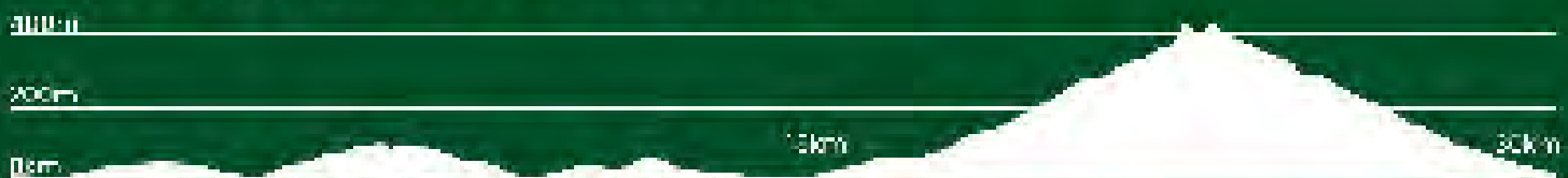
Cloghane to Dingle | Elev Gain: 583m / 1916ft