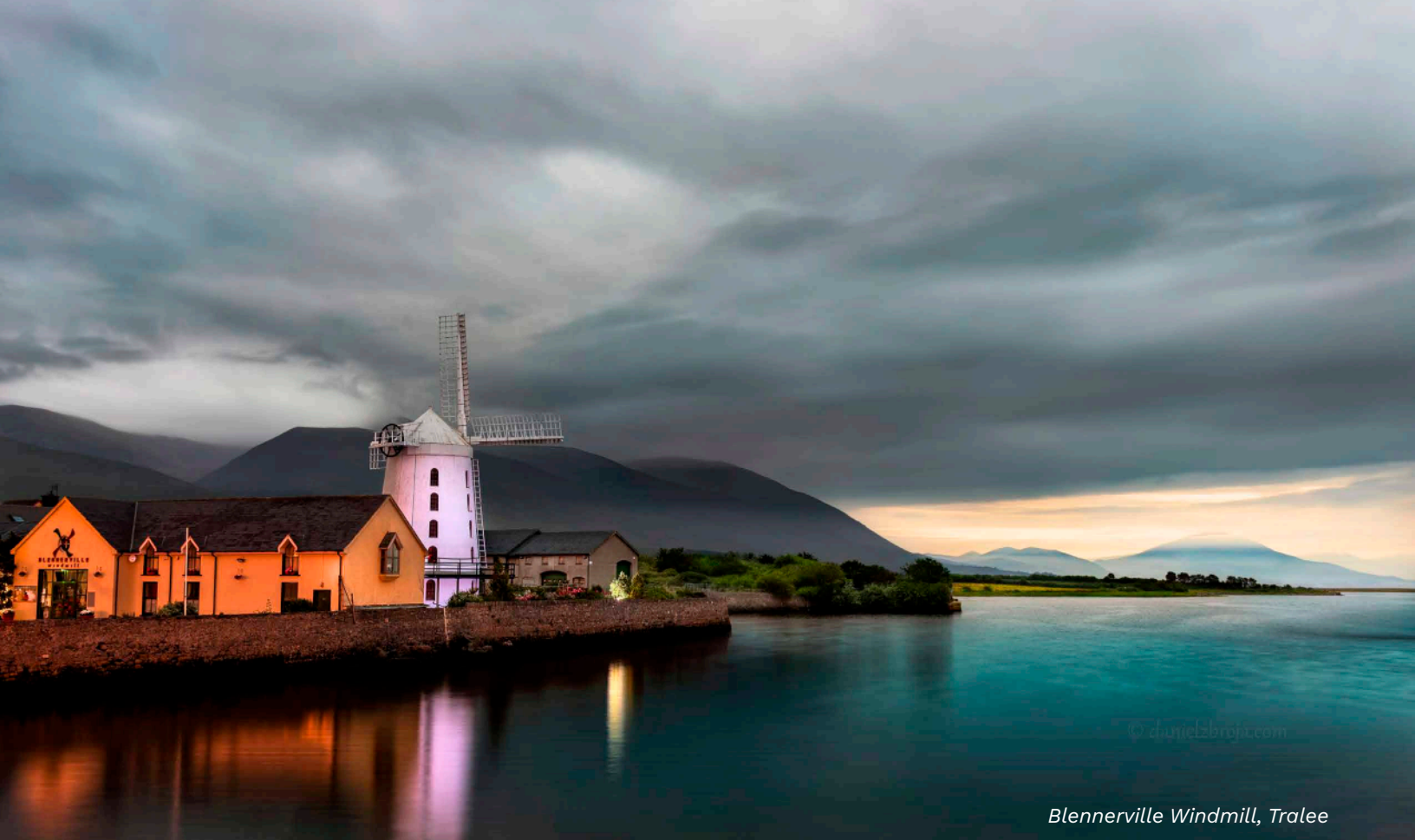
Blennerville Windmill, Tralee