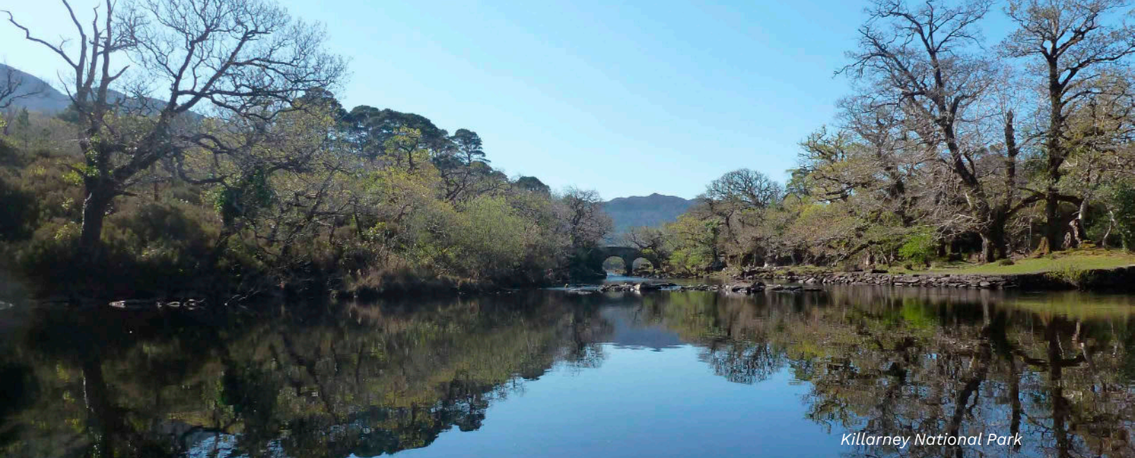
Killarney National Park