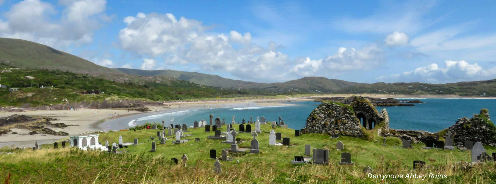
Derrynane Abbey Ruins