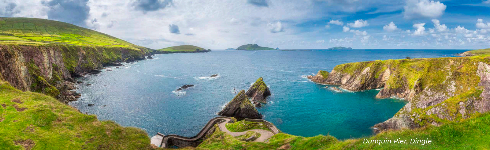
Dunquin Pier, Dingle