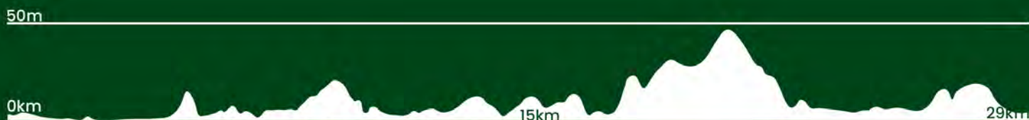
Fenit Loop Cycle | Elev Gain: 200m/ 656ft

Please see below daily elevation graphs for your selected tour