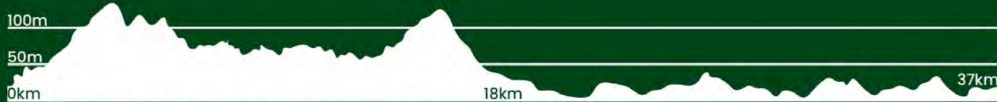
Glenbeigh to Cahersiveen | Elev Gain: 413m/ 1355ft