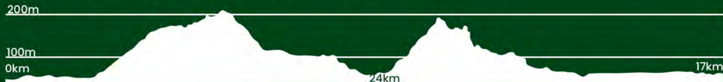
Kenmare to Killarney | Elev Gain: 626m/ 2053ft