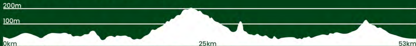
Cahersiveen to Sneem | Elev Gain: 612m/ 2007ft