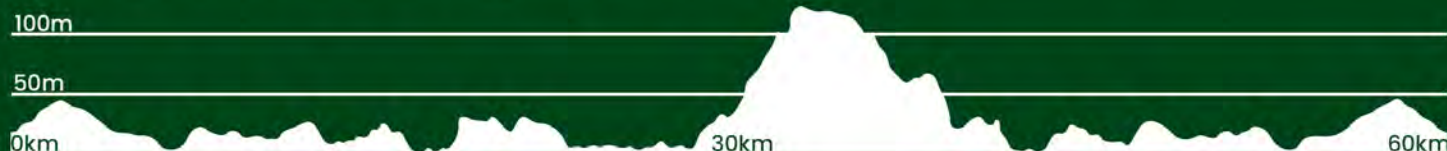
Valentia Loop | Elev Gain: 400m/ 1312m