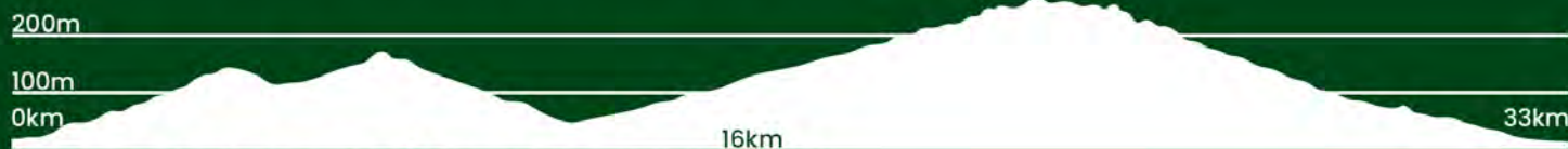
Sneem to Kenmare | Elev Gain: 444m/ 1456ft