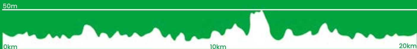
Muckross Loop Cycle | Elev Gain: 200m/ 656ft

Please see below daily elevation graphs for your selected tour