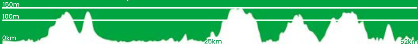
Clonakilty to Kinsale | Elev Gain: 644m/ 2115ft