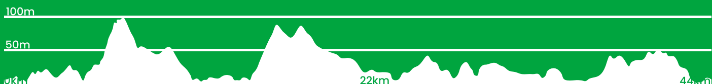
Bantry to Skibbereen | Elev Gain: 716m/ 2350ft