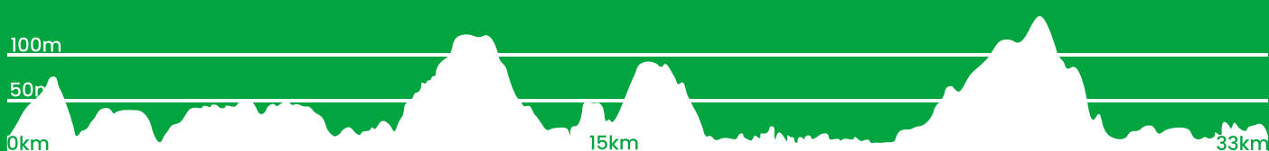
Kinsale to Cork | Elev Gain: 684m/ 2050ft