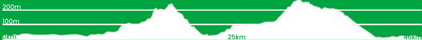
Killarney to Kenmare | Elev Gain: 590m/ 1935ft