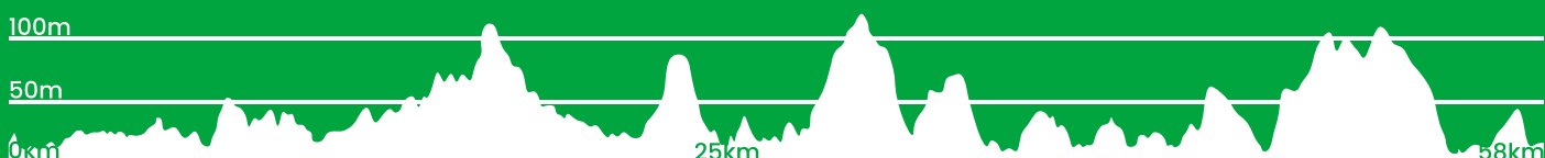
Skibbereen to Clonakilty | Elev Gain: 795m/ 2610ft